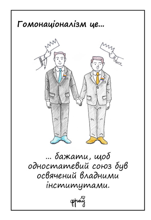
Figure 2b. "Homonationalism is ... a desire for one's union to be blessed by the power institutions." The image portrays two male-looking persons holding hands. They wear grey suits with rainbow pins; their ties and shoes are blue and yellow. Two somebody's hands hold crowns over the couple's heads, symbolizing a marriage ceremony. The hand on the left wears prayer beads with a crucifix; the hand on the right is dressed in a formal suit.