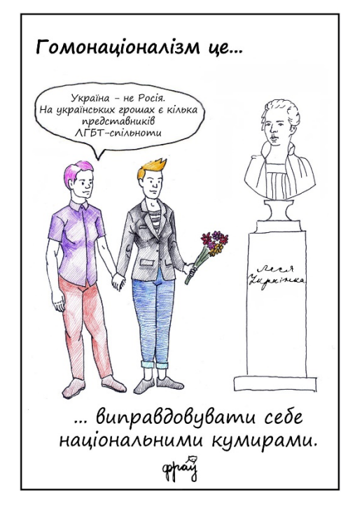
Figure 2c. "Homonationalism is ...to legitimize ourselves by national celebrities." The image shows two masculine female-looking figures holding hands. Their short hair is pink and yellow; their attire is colorful. They brought a bouquet of flowers to a bust monument Lesya Ukrainka. Text in a bubble reflects their speech: "Ukraine is not Russia. There are several representatives of the LGBT community on the Ukrainian banknotes."