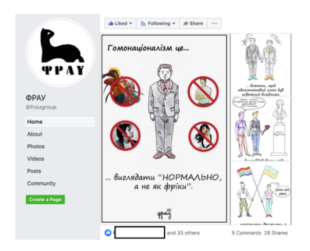
Figure 1. A screenshot of the FRAU Facebook page with comic series "Homonationalism is ..." (Posted on November 1, 2015). The post featuring four original drawings had been subsequently liked by 34 users, commented on by 5 users, and shared 28 times.

The story of this paper began in November 2015 with a comic series "Homonationalism is …" created by the FRAU<sup>1</sup> collective and popularised via Facebook. The series consisting of four caricatures offered examples of what homonationalism looked like in the Ukrainian context at that time (Figure 1). Being widely proliferated, the comic series evoked an explosion of debates that hit a nerve in LGBTQ communities because of being connected to one of the most pressing political issues in contemporary Ukraine—belonging to the nation and patriotism in relation to LGBTQ rights and activism.