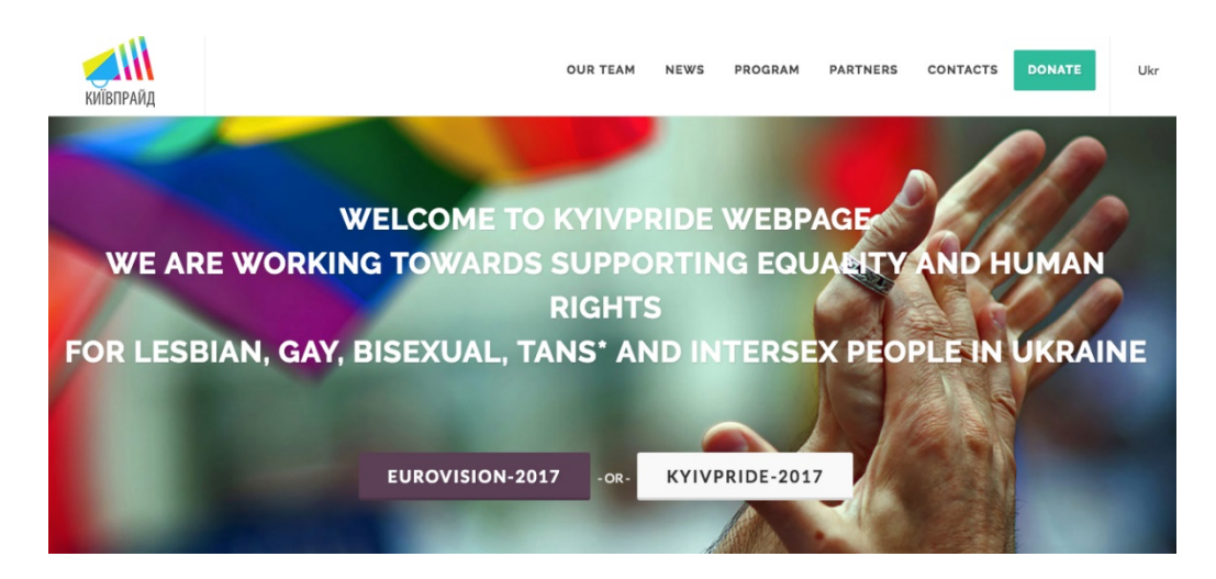
Figure 3. The homepage of the Kyiv Pride official website, 2017.<sup>17</sup> The image features two touching hands against a rainbow background. At the center of the page, a choice between two buttons, "EUROVISION-2017" or "KYIVPRIDE-2017," has been offered.

Pride organizers and other LGBTQ NGOs considered Eurovision to be a unique opportunity to promote the LGBTQ agenda. On the one hand, they used the extensive media coverage of Eurovision to draw attention to the insufficient protection of LGBTQ rights and the multiple cases of homophobic and transphobic violence in Ukraine. On the other hand, the tone of such publications was often balanced so that it did not prevent a potential international audience from visiting Ukraine. To assure guests that Kyiv is a "safe" city, Kyiv Pride published a map of LGBTQ-friendly places. Simultaneously, "We are friendly" rainbow stickers were distributed in bars, shops, and clubs that were indicated on the map (typically, expensive highstreet enterprises). Notably, both the map and the stickers were in English only. These details are telling with respect to which LGBTQ-subjects were "included" in the category of consumers: rich English-speaking tourists. Through this discourse, the specific positioning of Ukraine in the global geography of "LGBTQ progress"—developed enough to visit and yet in need of international aid—was reaffirmed.