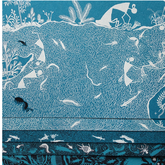
Figure 2: Page from inside the book, featuring a blue surface with white etching-like marks, exemplifying the use of geometric shapes and clean lines used in Warli art. Triangles are used to denote human beings, small straight lines are the water, and longer curvy lines are used for aquatic life, like snakes and fish.

cultural and natural surroundings can be taken for granted. The artists say, “Warli art was simply there, we didn’t pay much attention to any of it” (Vayeda 2020, 2). The ensuing distance intensifies the longing for their cultural roots, urging them to appreciate and learn more about their autochthonous cultural practices, while seeking ways to conserve them for future generations.