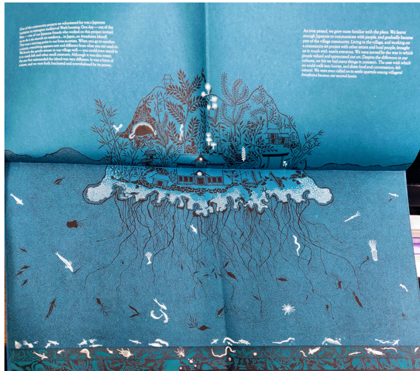
Figure 3: A page spread with the giant jellyfish, representing the Awashima Island, occupying the center of the page, with a house sitting in its middle. The jellyfish and house are rendered in black outlines with some white elements against a blue backdrop.

While the island is adorned with images of local flora and fauna, it has at its center, a house. This abode signifies how in an unknown land, amidst an unfamiliar culture, the brothers find love and respect. The story is not only about these two young men encountering unfamiliarity within a foreign nation, but also about their individual exploration as artists, interrogating the two cultures they are navigating—that of India and Japan. In other words, the narrative is a two-fold journey, both outwards, beyond the known limits, as well as an inner plunge into who they are, as artists and as individuals. The journey the brothers undertake also invites readers to probe their own existence and connection with nature and each other.